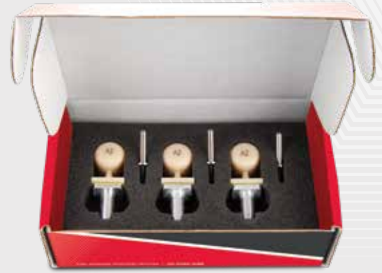
Sold in 3-block packs that include 3 single-use burs