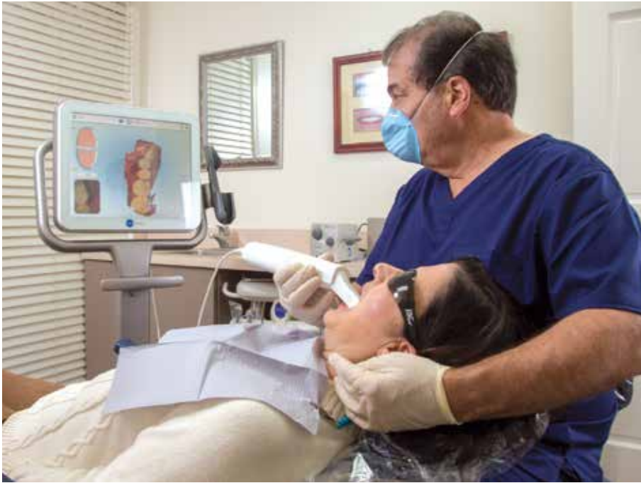
The glidewell.io Solution gives dentists a powerful, connected suite of CAD/CAM tools that satisfy the demands of everyday clinical routines.

“ The glidewell.io Solution offers myriad treatment pathways, each concluding with reliable restorative results. ”