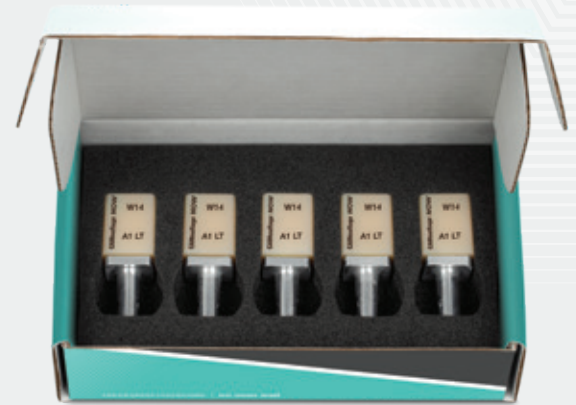
Sold in 5-block packs